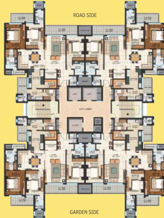
3 BHK 6th, 7th, 8th, 9th, 14th Floor