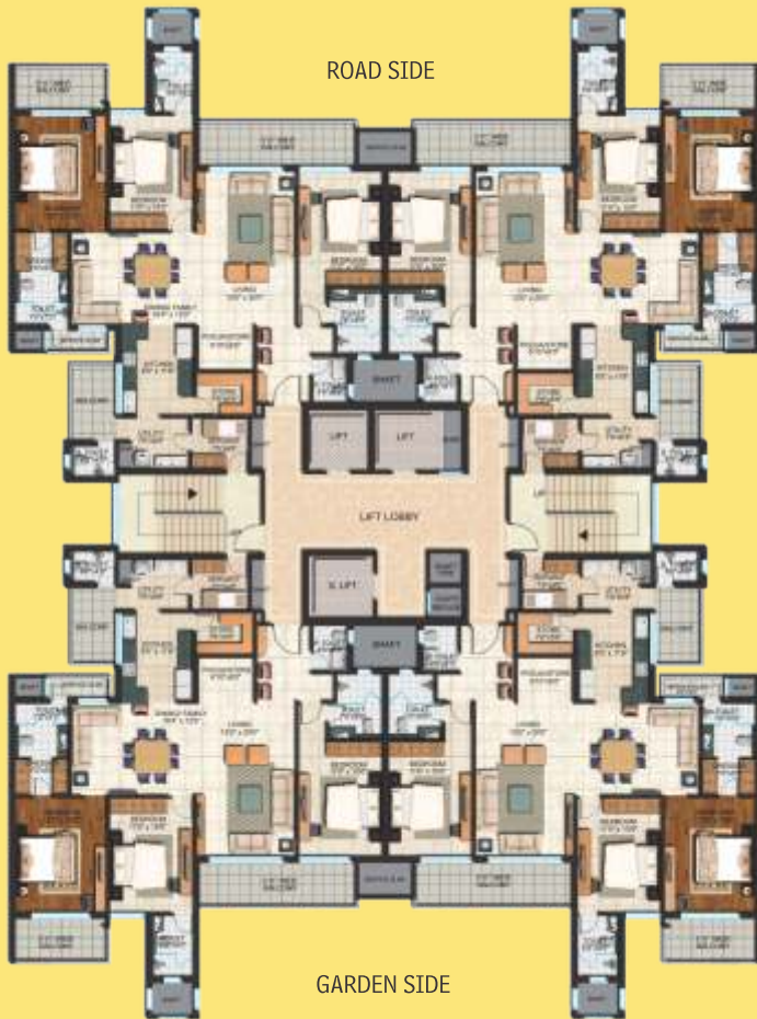
3 BHK 2nd, 3rd, 4th, 5th, 10th, 11th, 12th, 13th Floor