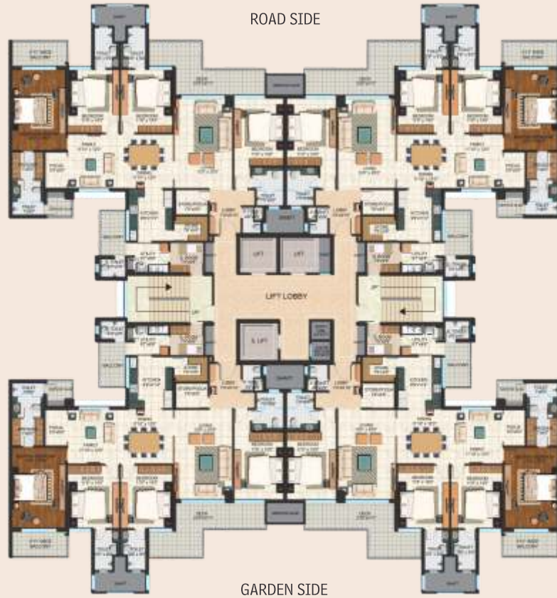
4 BHK 2nd, 3rd, 4th, 5th, 10th, 11th, 12th, 13th Floor